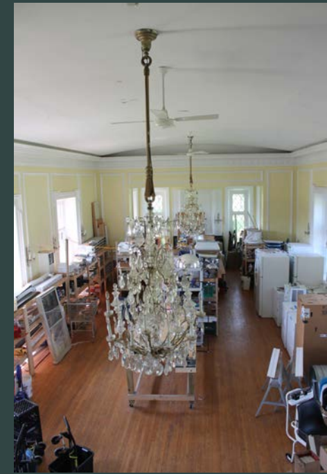
Private entrance event room