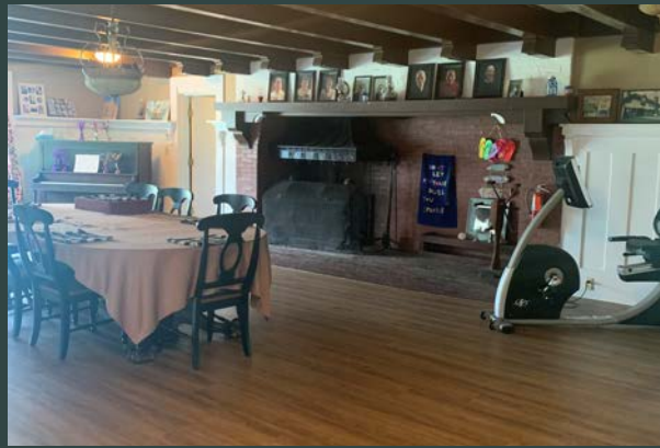
Wood beam ceilings and prominent fireplace