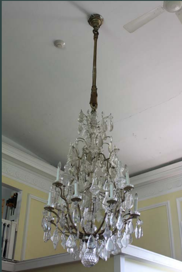
Crystal chandelier in Roberts Hall