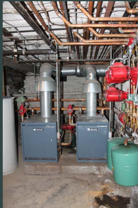
Updates in mechanicals